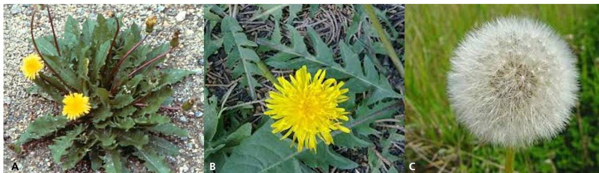
Fig. 1. A, Dandelion herb, B, its flower, and C, ripe fruits.